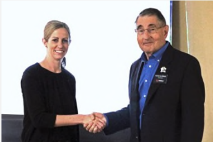
AZCOC Meeting 8 Nov 2019