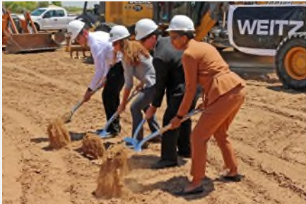
Arizona State Veterans Home (Yuma)