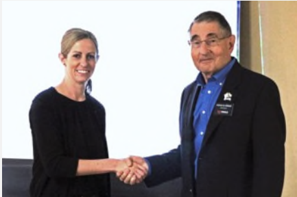
AZCOC Meeting 8 Nov 2019