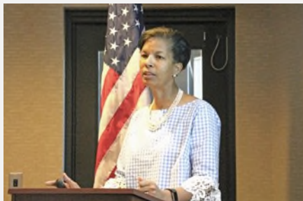
AZCOC Meeting 3 May 2019